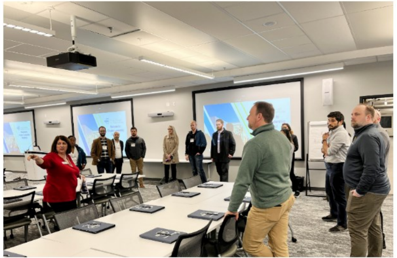
Chapter Leadership Academy ASHRAE Headquarters | Atlanta, GA January 10-11, 2025

NEW! Thanks to generous support from the ASHRAE Foundation, each region can send up to 4 participants . Flight, hotel, food, and class materials are included . Other expenses incurred are at the expense of the region, chapter, or individual. Notify your DRC or RMCR by October 11th if you are interested in participating.