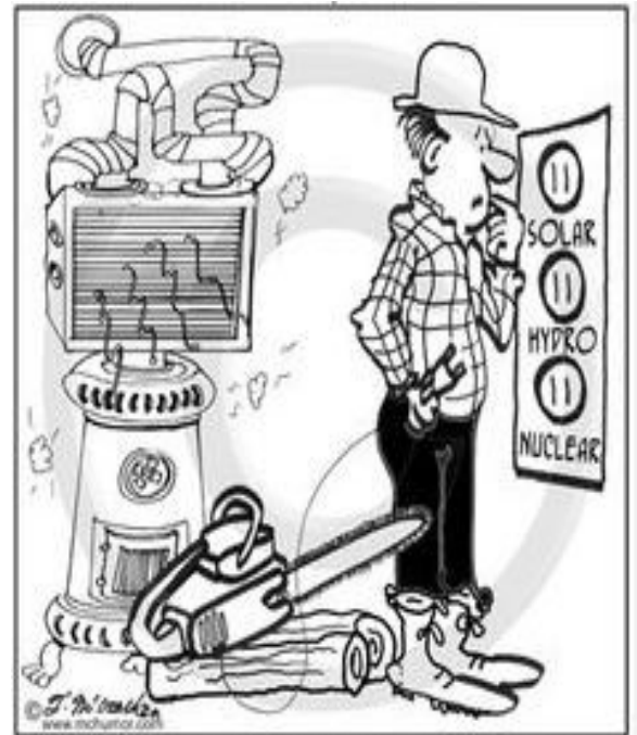
Fred deciding which sort of power to use to cut wood for his wood burning air conditioner.